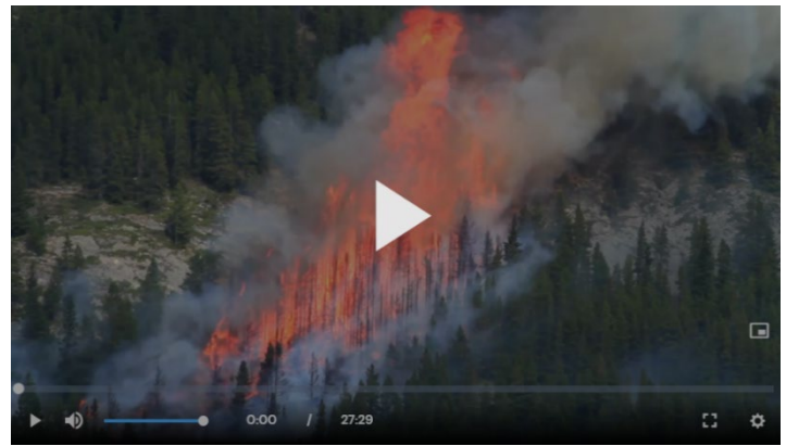
Washington's Wildfire Divide