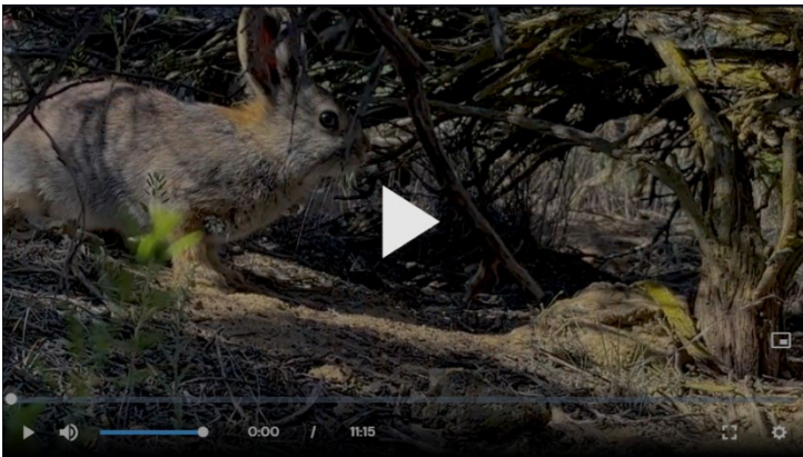
Pygmy Rabbits, Giant Trouble